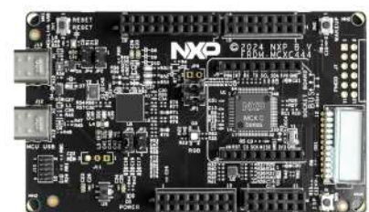
FRDM-MCXC444 FRDM Board