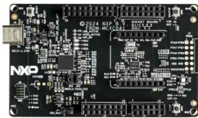
FRDM-MCXC041 FRDM Board

Developers have easy access to additional tools like our Expansion Board Hub for add-on boards and the Application Code Hub for software examples through the MCUXpresso Developer Experience.