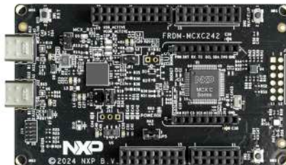
FRDM-MCXC242 FRDM Board